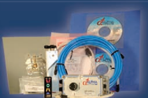
Kit comes Standard with Instrument Panel Mount Brackets

The "Standard Legacy" line of AOA display kits utilize ultra bright LED driven colored segments to give the pilot AOA readout when calibrated to the aircraft. The "Standard Legacy" display is housed in a billet aluminum case and comes standard with panel mount brackets. Additional glare shield mounting options allow for the display to be mounted above the glare shield in the pilot's peripheral vision. Kit comes complete with all parts, documentation and connectors prewired for simple assembly.