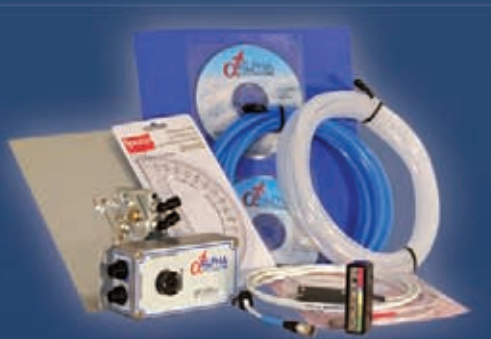
Kit Pictured with Ultra 2 1/2" Vertical Display

The "Standard Ultra" line of AOA display kits have the same great features as the "Standard Classic" in a smaller more compact package. Kit features 16 (3mm) ultra bright colored LED's in both vertical and horizontal display versions housed in a billet aluminum case. Additional glare shield mounting options allow for the display to be mounted securely above the glare shield in the pilot's peripheral vision. The "Standard Ultra" kits come with all parts needed to install in most aircraft without modifications.