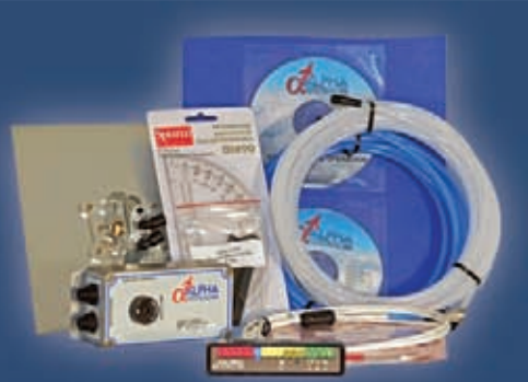
Kit Pictured with 4" Horizontal LED Display.

The "Standard Classic" line of AOA display kits incorporate 16 (5mm) ultra bright, colored LED readout of available lift when calibrated to the aircraft. 3 versions, round 2 1/4" panel mount, vertical and horizontal in-line bar graph display styles. The "Standard Classic" kits come with all parts needed to install in most aircraft without modifications.